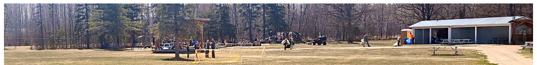
Almost 45 people showed up and made quick work of cleaning up Dawson Trail Park in Richer.

the Provincial Health Orders. Our Modular Skateboard Park is ready to go along with ball hockey nets and basketball hoops under the Premier Tech Multiplex. The BMX hill is ready for bikes and hanging out. The playground structure area is raked up and ready for visits. THANK YOU!