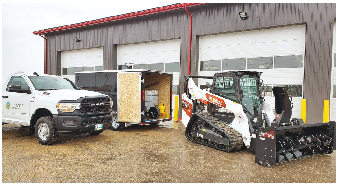
The Public Works Department is pleased to announce they have acquired an Ice Steamer unit (trailer-mounted), a Tracked Bobcat with 84" Snowblower, and a 3/4 Ton Truck with Tilt Deck Trailer to allow equipment to access all areas of the RM.