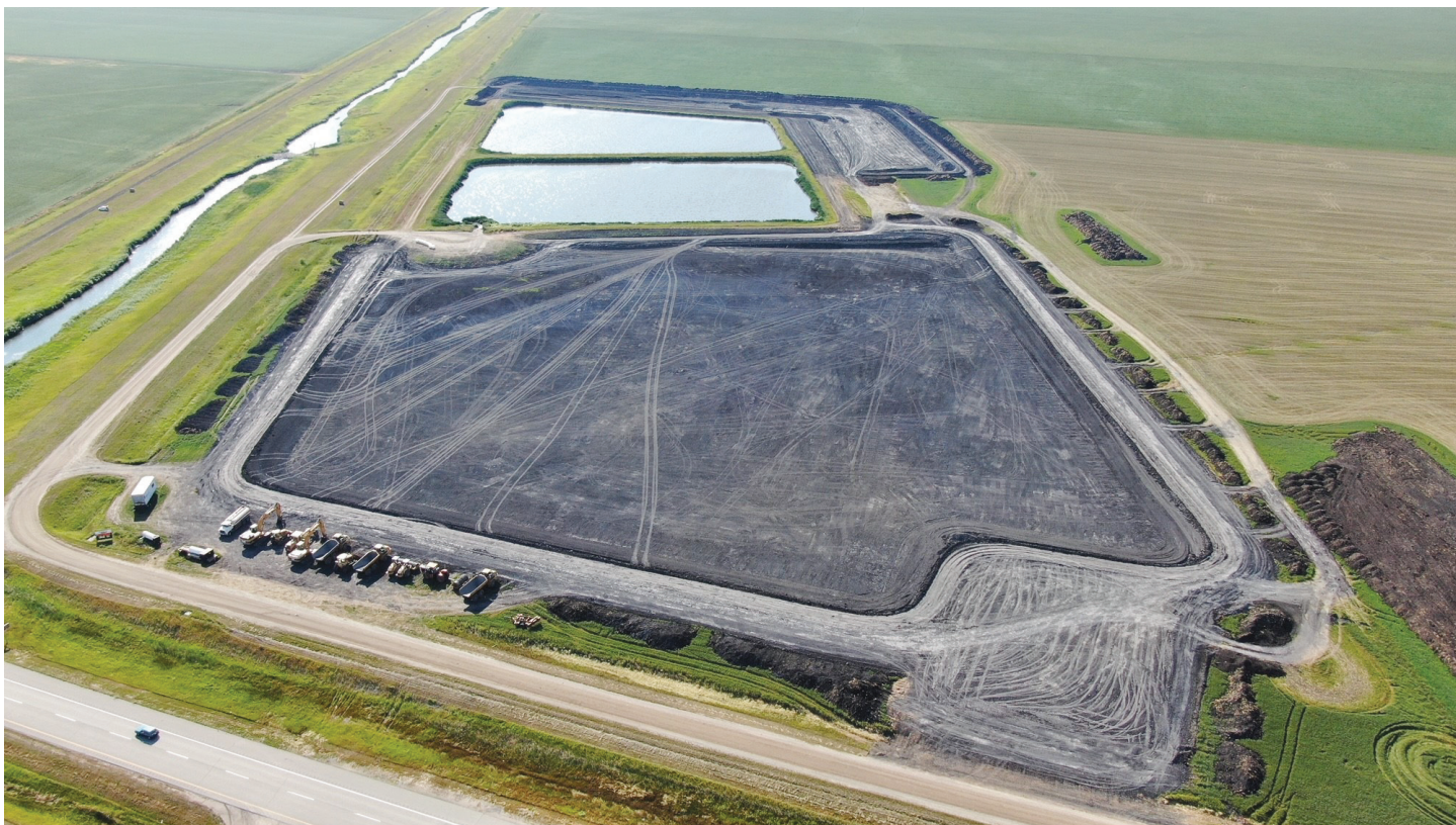
Drone footage of the RM of Ste. Anne lagoon showing the expansion cell which will be planted with cattails to filter wastewater.