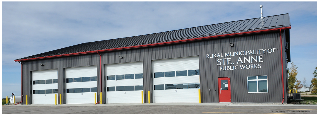
The new RM of Ste. Anne Public Works facility is now in service, located just south of the Municipal Building.

In addition to more floor space for the heavy equipment, the bays are drive-through and a wash bay