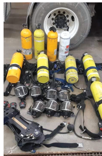
Donated equipment (FB)

FWB helps fire departments in need by coordinating the refurbishment and delivery of donated fire-fighting equipment.