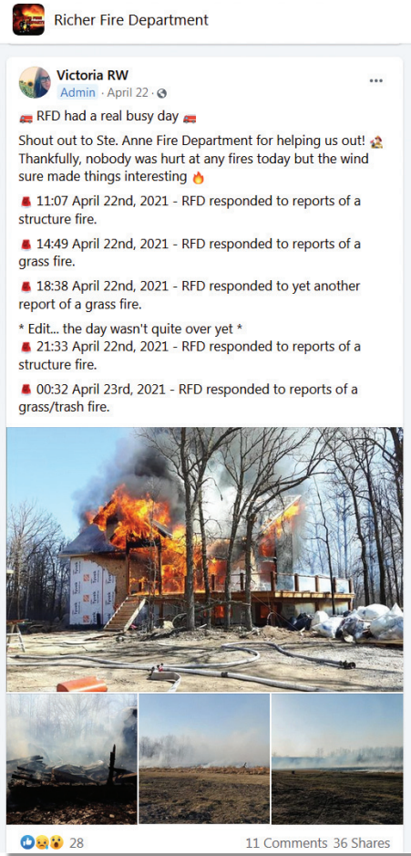
Richer Fire Department April 22nd, 2021 report (FB)

2021 has been a year with MANY brush, grass, structure and forest fires, both in the extremely dry spring season and later throughout the summer and dry autumn periods. Several years of drier than usual weather have taken their toll and our local volunteer fire departments have had periods of being under pressure keeping up with multiple call outs within a 24 hour period.